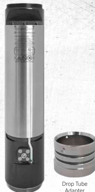
Drop Tube Adapter

The Defender Series® Overfill Prevention Valve (OPV) prevents the overfill of an underground storage tank during a gravity-fed product delivery. It employs a revolutionary magnetically-coupled actuator system to provide positive shutoff. This unique method of shutoff eliminates any penetrations in the valve, making it both vapor and leak tight. This also allows for remote compliance testing of the primary functionality at grade level without having to remove the OPV from the tank.